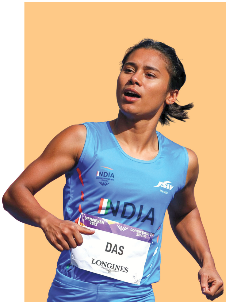
Hima Das (Athlete) Gold Medalist (World U20 Championship) Gold Medalist (Asian Games 2018) Pursuing MBA @ RGU

THE ASSAM ROYAL GLOBAL UNIVERSITY (RGU) PROMOTES EXTRACURRICULAR ACTIVITIES AS AN INTEGRAL PART OF STUDENT LIFE RECOGNIZING ITS VITAL CONTRIBUTION TO THE PERSONAL DEVELOPMENT AND WELL-BEING OF STUDENTS. RGU BELIEVES THAT EXTRACURRICULAR ACTIVITIES BROADEN STUDENTS' MENTAL HORIZON, FOSTER INCLUSIVITY, DIVERSITY, AND PROMOTE EXCELLENCE IN STUDENT PERFORMANCE, THEREBY SHAPING RESPONSIBLE, CONFIDENT, AND WELL-ROUNDED CITIZENS.